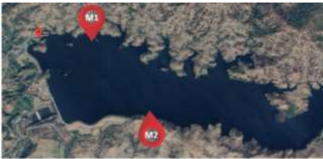
Fig. Satellite view of Mor Dam showing M 1 and M 2 sites

Mor dam (Latitude 21° 14' 45' N and longitude 75° 47' 30"E) is situated on Mor River near Hingona, Tal Yawal, district Jalgaon. Dam is completed in 2003. The dam water is primarily used for drinking and irrigation purpose. The catchment area of the dam is 74.42 sq/km. The height of dam wall is 44.60 meter.